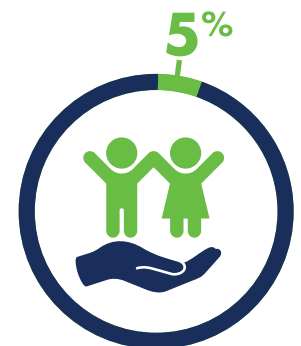
On-campus childcare facilities only serve 5% of the children in need.

Student parents struggle to find access to affordable childcare, particularly on campus. The share of postsecondary institutions offering on-campus childcare has been on the decline in recent years, particularly at community colleges, where the majority of student parents are attending. 21 Even for campuses that do provide childcare, most have prohibitively long waitlists. 22 Parents with children under the age of two have a particularly difficult time finding access to care because many on-site facilities do not care for infants. 23 It is estimated that on-campus childcare facilities across the country only serve five percent of the children in need. 24